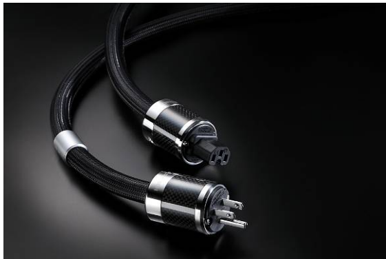
Piezo Powerflux -18

NEW for 2008 • Piezo Powerflux Power Cord Featuring FI-50M(R) Piezo Ceramic Series Power Connectors