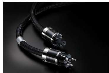
Piezo Powerflux -18E

May Be the Most Sophisticated Power Cord and Connectors in the World