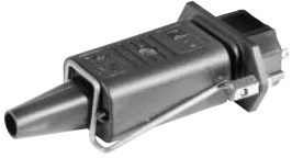
Cord retaining kits